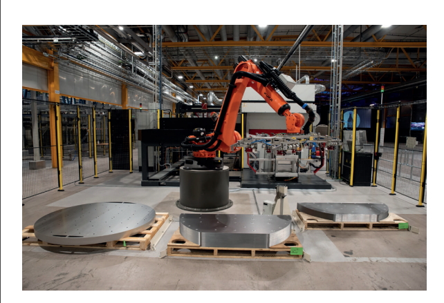
Nel alkaline electrolyser production

Through the analytical technique of radiocarbon dating, the proportion of biogenic and fossil \mathrm{CO}_2 can precisely be measured. This will be essential to ensure that the WtE plant operator pays the correct fee for their \mathrm{CO}_2 emissions and will simultaneously enable accurate assessment of the biogenic fraction of \mathrm{CO}_2 that is captured from the WtE plant flue gas.