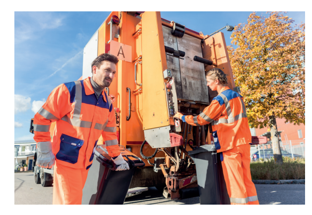
MSW has a high biogenic fraction