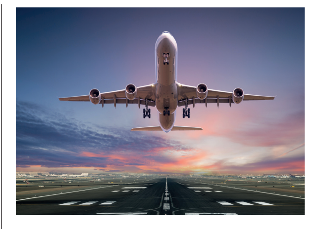
Power to \boldsymbol{X} can be used to make sustainable synthetic aviation fuel

supply the additional biogenic \mathrm{CO}_2 molecules. And, when these sources are sold-out, Power to X plants will be forced to seek alternatives such as \mathrm{CO}_2 from direct air capture (DAC).