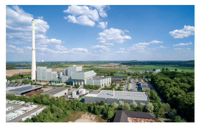
Kamp Lintfort Waste to Power plant, Germany

Bio-energy {\rm CO_2} capture and utilisation or storage has generally been linked to the combustion of wood chips to generate power. In 2022, Drax Power Station in the UK, which can generate up to 2.5 GW, emitted 12 million tonnes of {\rm CO_2} , making it the UKs largest single emitter of {\rm CO_2} in the power sector. This {\rm CO_2} is regarded as climate neutral since it was drawn out of the air by the trees.